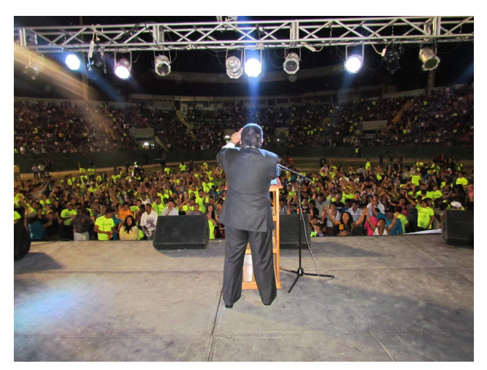
April 5, 2014

Many received Jesus as their personal Lord and Savior. The baseball stadium, Chochi Sosa, in Tegucigalpa, Honduras was filled with the glory of God. It was an extraordinary evening!